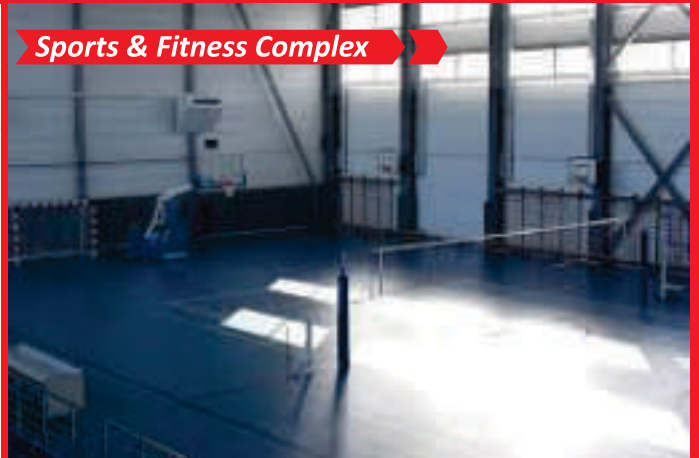
Sports & Fitness Complex